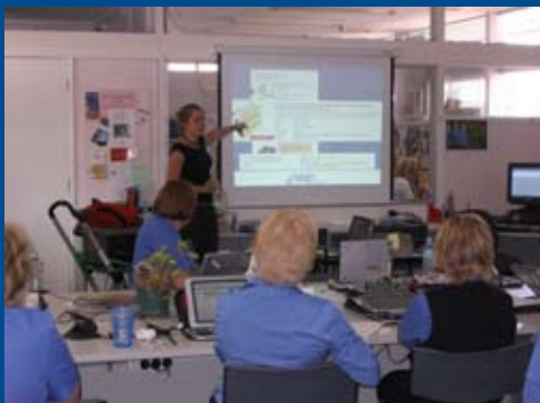
Presentation at RDNS Frankston

If you would like an Information Pack sent out to you, or to book an inservice please contact e.qquip on 1300 137 442.